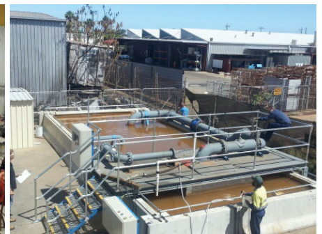
Wet well test facility for submersibles in WA

Irrespective of where the pump comes from, PIA encourages customers to consider performance testing of pumps to AS 2417 to ensure that products actually do meet the nominated flow, head and efficiency specified. Many of our members can offer such a service within their routine QA programs and several are accredited by NATA certification.