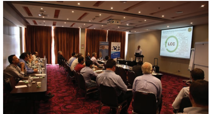
Pump Seminar in Sydney 2014