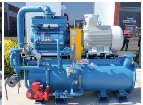
Large vacuum pump set assembled in Victoria

As the industry has rationalised, several of our multi-national members have brought in components manufactured offshore to benefit from global R&D and economies of scale from large factories overseas. More emphasis has been placed on machining, assembly and testing of the finished product by both local and overseas owned companies. This has resulted in a blossoming of companies who have the expertise and experience of Australian conditions to build "customised pumping equipment" that provides a comprehensive solution to a pumping application. Many of the recent additions to PIA membership operate in this space and provide a high level of client support to sustain their business.