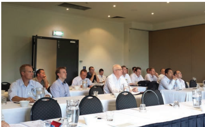
Pump Seminar in Melbourne