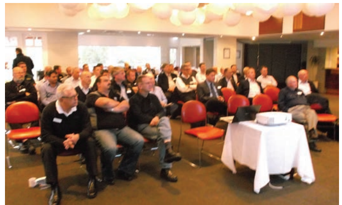
Technical presentation in Perth