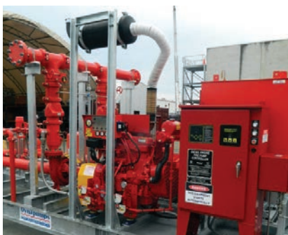
Large package firepump set built in Western Australia

As the industry has rationalised, several of our multi-national members have brought in components manufactured offshore to benefit from global R&D and economies of scale from large factories overseas. More emphasis has been placed on machining, assembly and testing of the finished product by both local and overseas owned companies. This has resulted in a blossoming of companies who have the expertise and experience of Australian conditions to build "customised pumping equipment" that provides a comprehensive solution to a pumping application. Many of the recent additions to PIA membership operate in this space and provide a high level of client support to sustain their business.