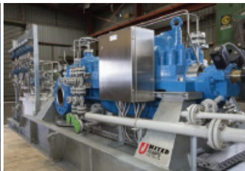
API 610 pumpsets produced in Melbourne