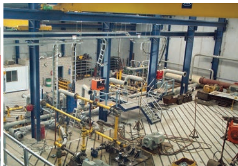
Specialist dry well pump test facility in Melbourne